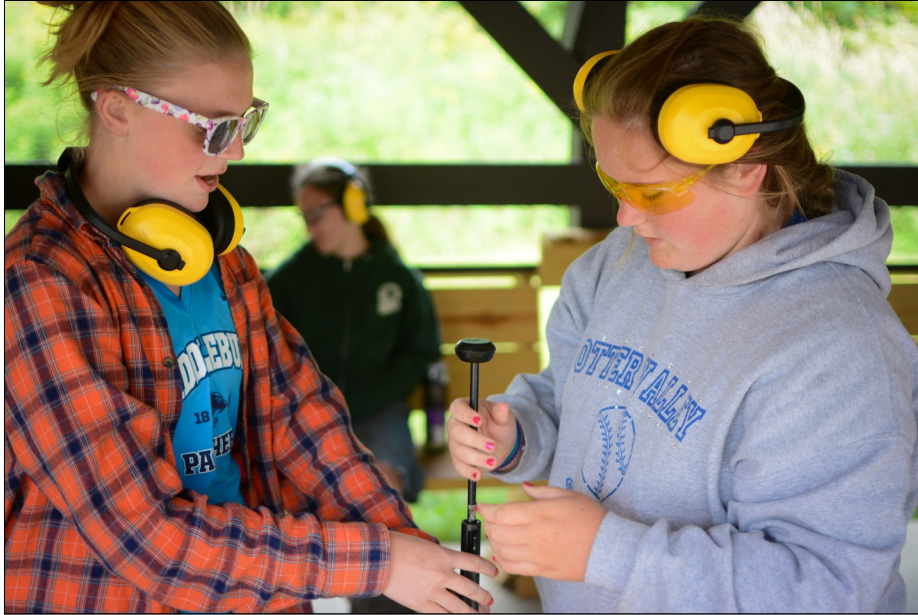
Girls loading a muzzleloader at Buck Lake Camp in Woodbury.

This season has been particularly special for the GMCC, as we are celebrating the program's 50 th year. "Lake Bomoseen camp" - now called Edward F. Kehoe, has been operating since 1966. The Buck Lake camp has been operating since 1973. This program has touched the lives of thousands of youths and their families for years and years.